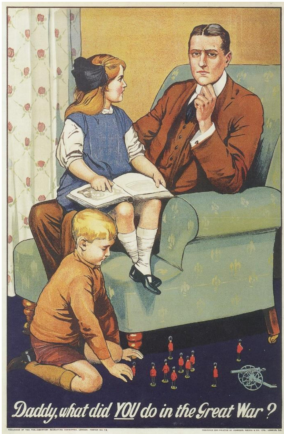
A recruiting poster produced in Britain in 1915